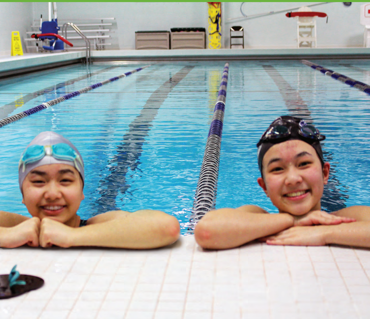
Members of our swim team, The Stingrays

Tufts Medical Center to support the Teen Center. We'll expand Generation Next Academy programming, add additional violence and addiction prevention programming, train staff in motivational interviewing techniques, conduct outreach activities and expand our popular media arts program to engage students in self-reflective media and journaling. This funding will enhance and expand this excellent program to meet the needs of our community's teens.