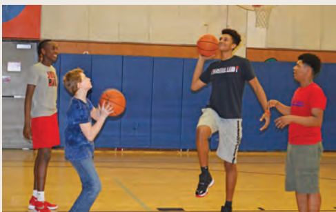
After school recreation sponsored by our Teen Center in the DotHouse gym.

In keeping with our history as a settlement house, DotHouse Health developed a Teen Center to improve opportunities for physical, emotional, and academic opportunities for young people in our community. Today, the Teen Center is responding to pressing needs, including those related to substance abuse and violence, through our Generation Next Academy (GNA). Since 2005, GNA has served young people ages 12-18 with a comprehensive suite of programs including tutoring, college and career workshops, life skills development, healthy relationship building, nutrition and fitness, substance abuse, HIV/AIDS prevention, service learning projects, media arts, and recreational and sports activities. At the end